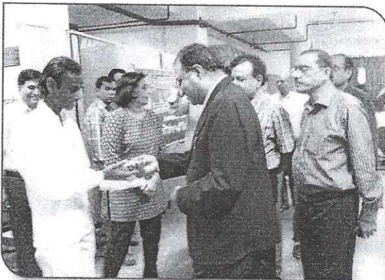
Distribution of spectacles to beneficiaries