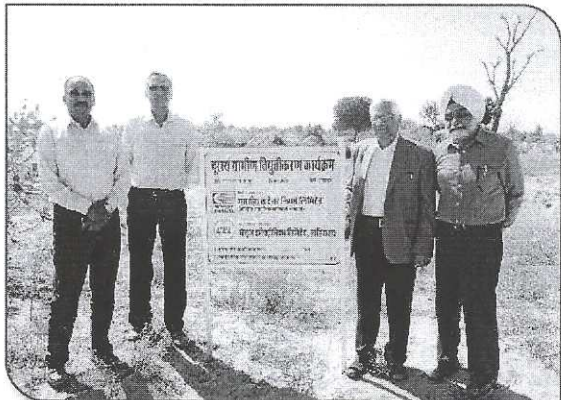
CONCOR officials visit in Jodhpur