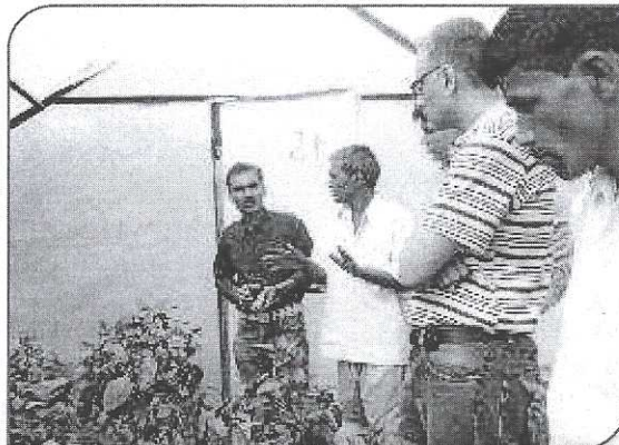
CONCOR officials inside a polyhouse at Mukteshwar, Uttarakhand

In F.Y. 2013-14 CONCOR committed for disbursement an amount of ₹ 10.38 crore towards its CSR & S activities against a target of ₹ 10 crore in the MOU signed with Ministry of Railways.