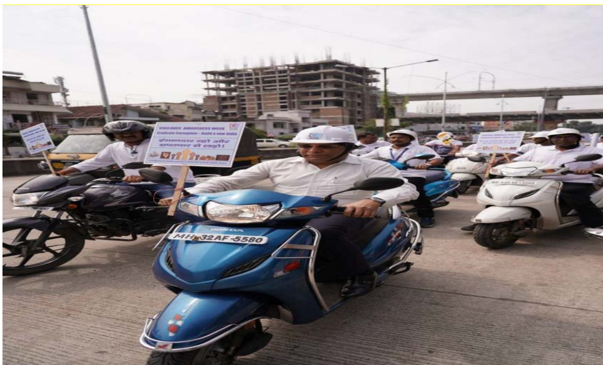
(Scooter Rally Organized Headed by CGM/CR on 31.10.2019 during the VAW) [Photo-C1]