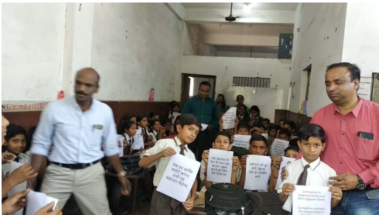
(Vigilance Awareness Guidance to Students of ‘Ezvenger Public School, Mandideep, Madhya Pradesh’)