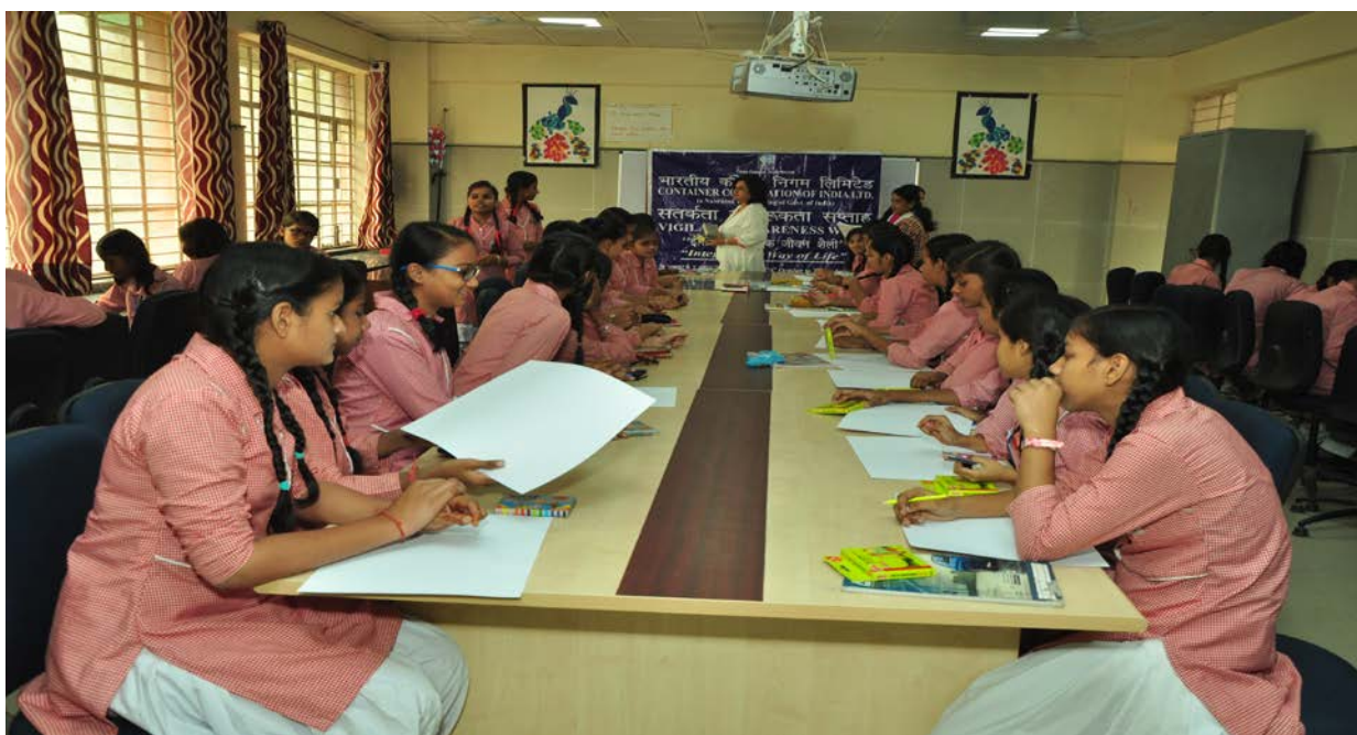
(Drawing Competition Organized at 'Rani Jhansi Sarvodaya Kanya Vidyalaya', Tughlakabad, New Delhi on 30.10.2019)