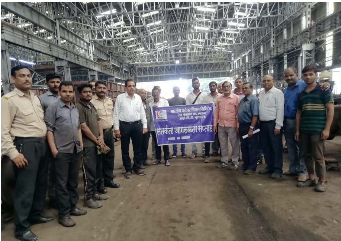
(Workshop organized at ICD/Bhusawal on 30.10.2019 with CONCOR & Railway Employees (ROH Deptt. of CR) and brief them about importance of integrity in day to day activities) [Photo-B10]