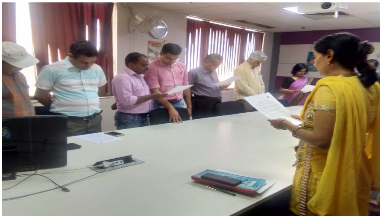
(Integrity Pledge was taken by the officials at North Central Regional Office, Noida during the week) [Photo-A8]