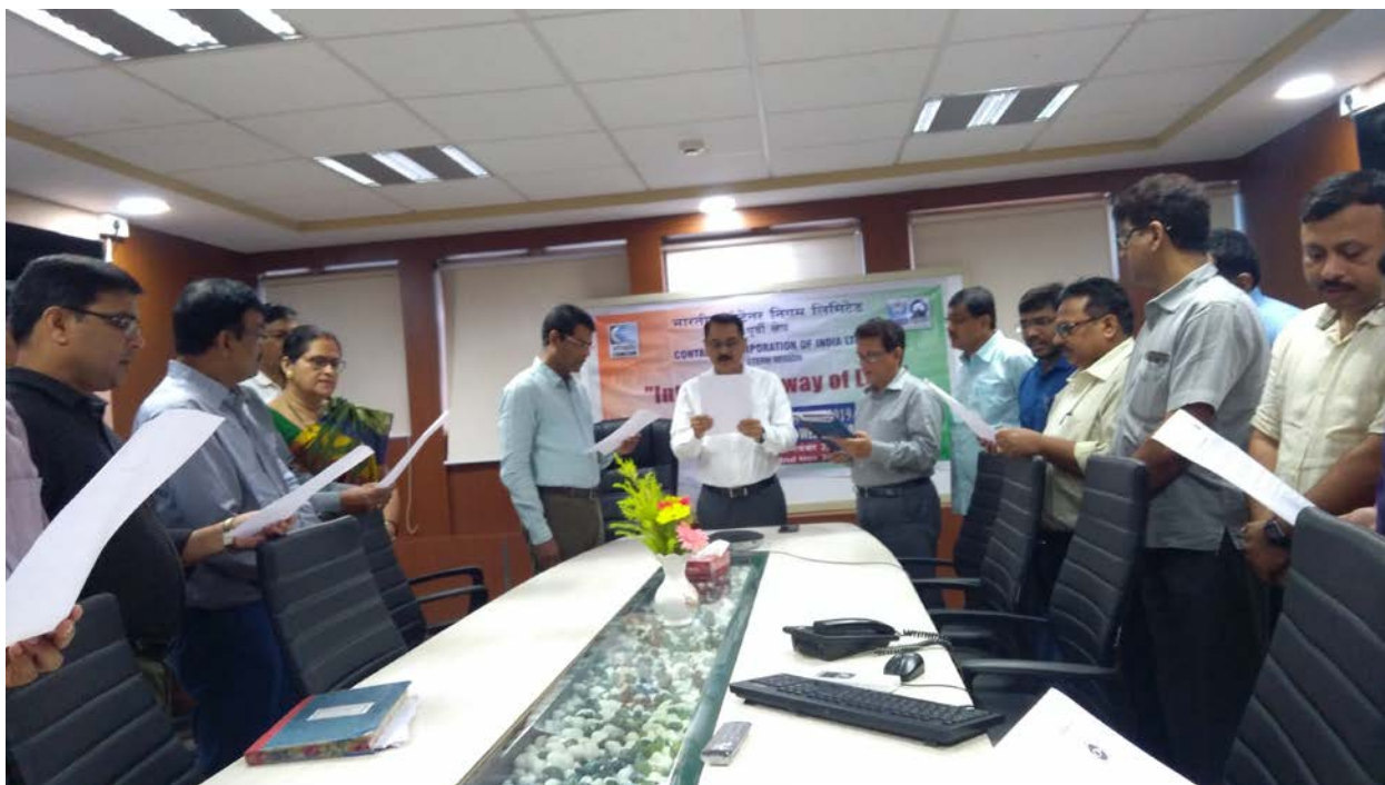
(Chief General Manager, Eastern Region administered the Integrity Pledge to the officials at Kolkata during the Vigilance Awareness Week) [Photo-A7]