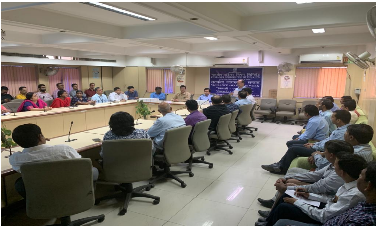
(Workshop Organized at ICD, Tughlakabad, New Delhi on “Integrity – A Way of Life”) [Photo-C12]