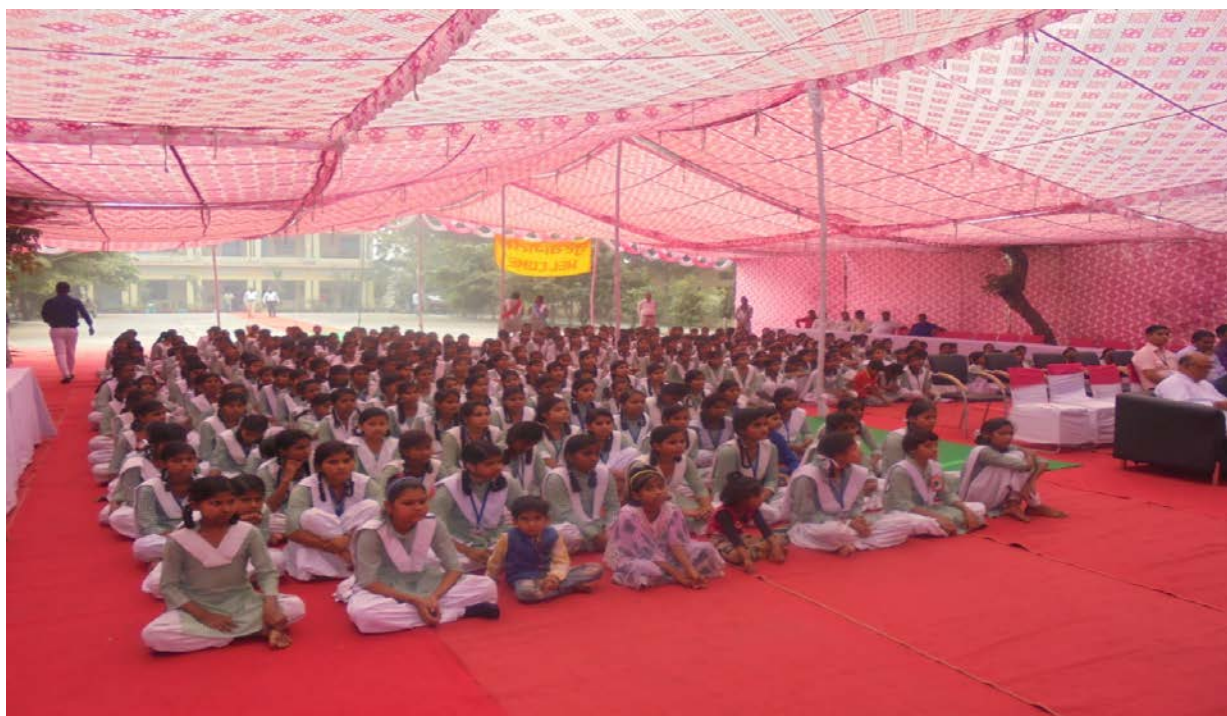
(Debate Competition & Cultural Programmes on “Integrity – A Way of Life” organized on 01.11.2019. at Adarsh Balika Inter College, Tilpata Village, Dadri)