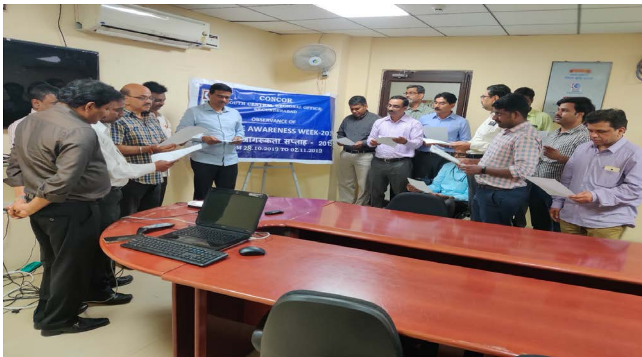
(Integrity Pledge was taken by the officials at South Central Regional Office, Secunderabad during the week) [Photo-A9]