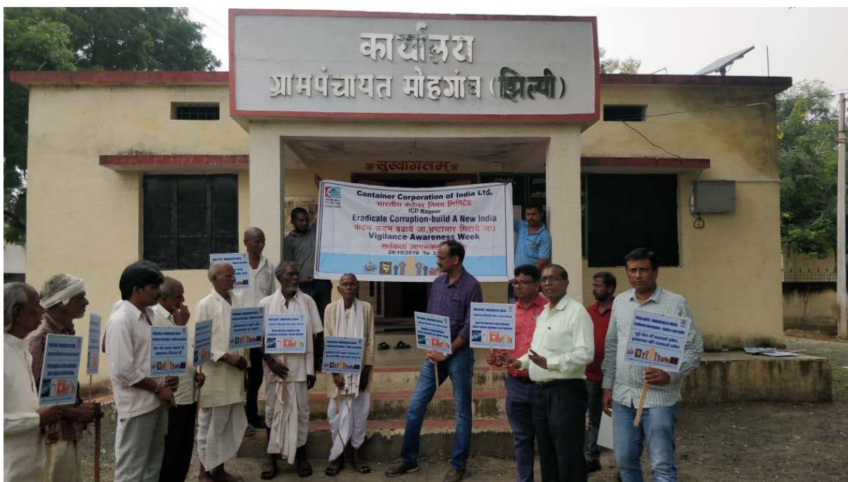
(Interaction Session with Gram Panchayat (Mohgaon-Zhilpi) Mahoba, Tehsil- Hingna, Maharashtra during the VAW) [Photo-C10)