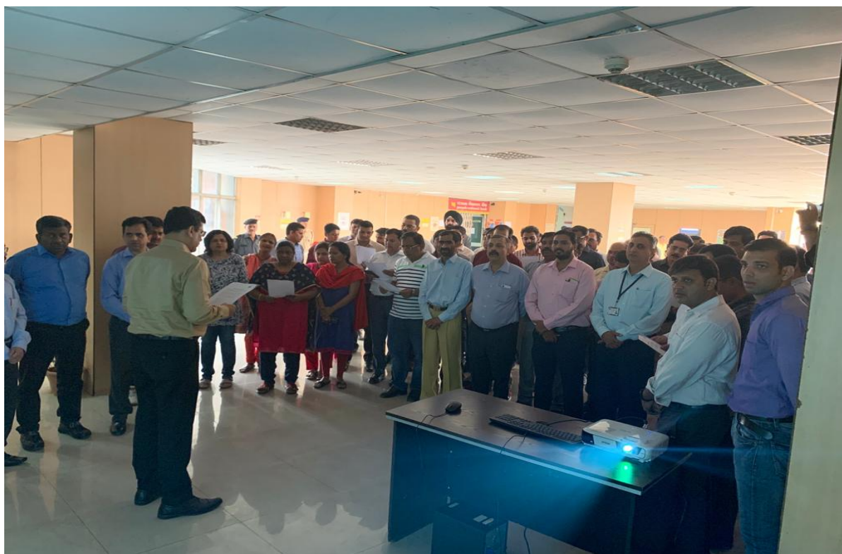
(Exeutive Director, Northern Region administered the Integrity Pledge to the officials at Tughlakabad, New Delhi) [Photo-A2]