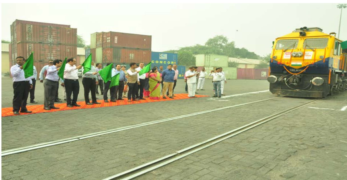
(Flagging off “Satarkta Express Container Train-2019” at Domestic Container Terminal, Okhla, New Delhi on 30.10.2019) [Photo-A12]