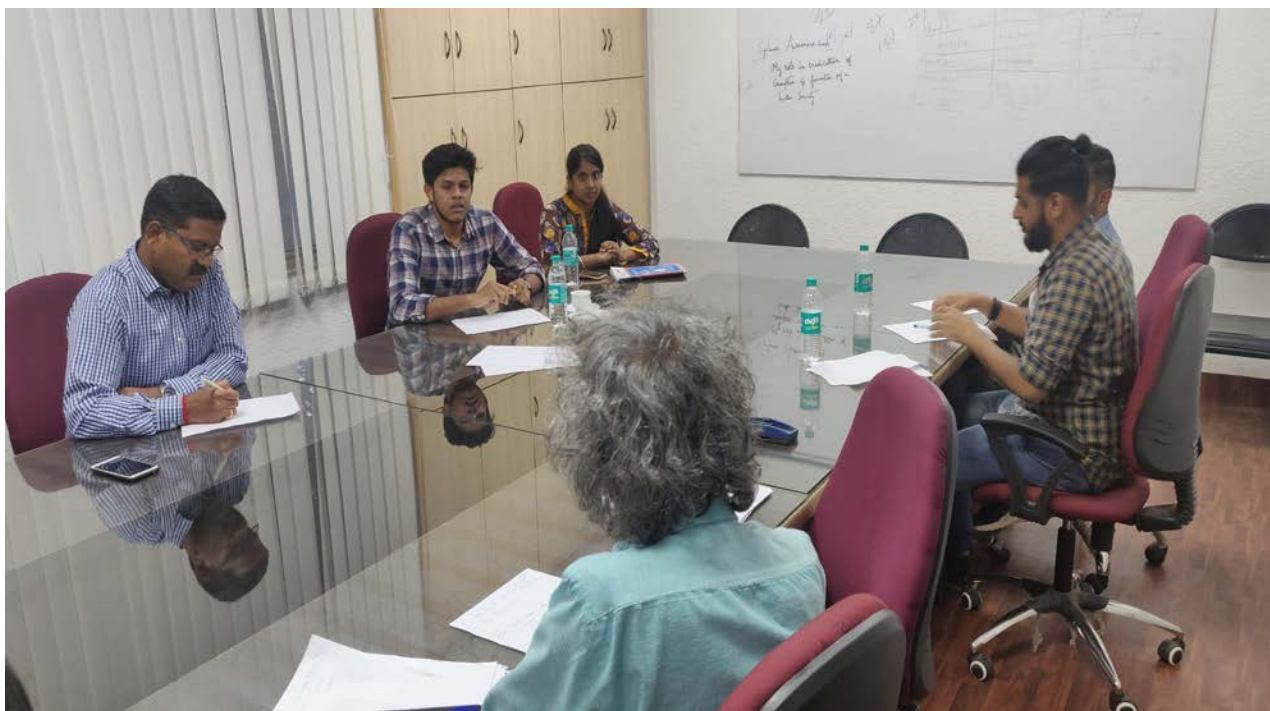
(Essay & Debate Competition Held at Bangalore for 'Next Step Logistics' during VAW) [Photo-C9)