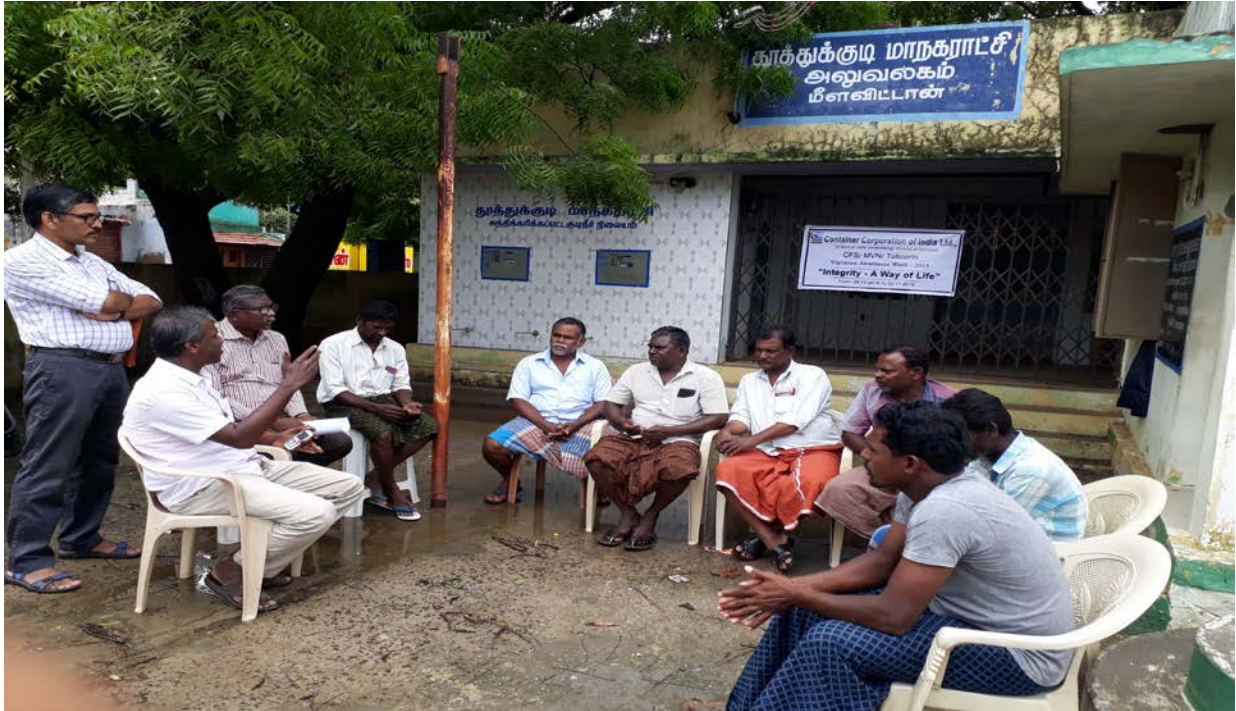
(Awareness Programme at Milavittan, Tamil Nadu during the VAW) [Photo-C11]