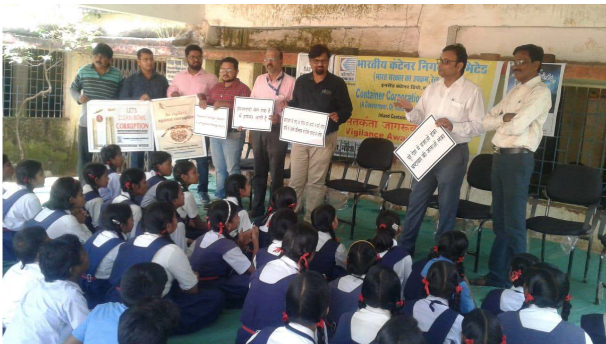
(Awareness Programme was organized at 'Govt. Higher Secondary School MoVA', Raipur, Chhattisgarh) [Photo-C5]