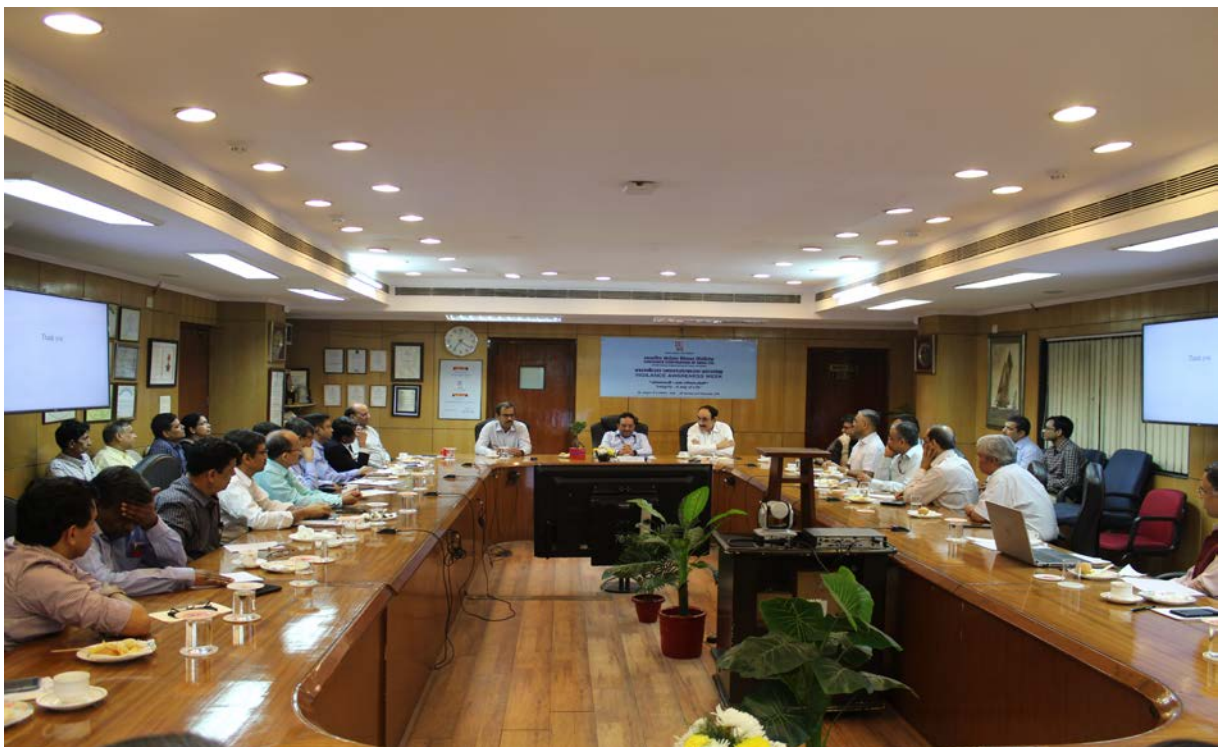
(Lecture on “Challenges in Procurement” at Corporate Office on 29.10.2019) [Photo-A14]