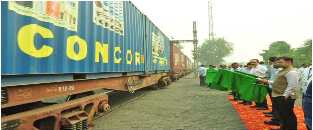
(Flagging off “Satarkta Express Container Train-2019” at Domestic Container Terminal, Okhla, New Delhi on 30.10.2019) [Photo-A13]