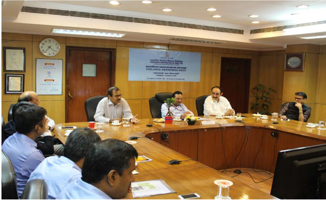
(Lecture on “Challenges in Procurement” at Corporate Office on 29.10.2019) [Photo-A-15]