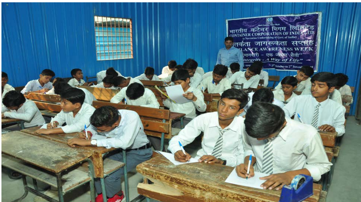
(Essay Writing Competition Organized at 'Sarvodaya Bal Vidyalaya', Tughlakabad, New Delhi on 30.10.2019) [Photo-C3)