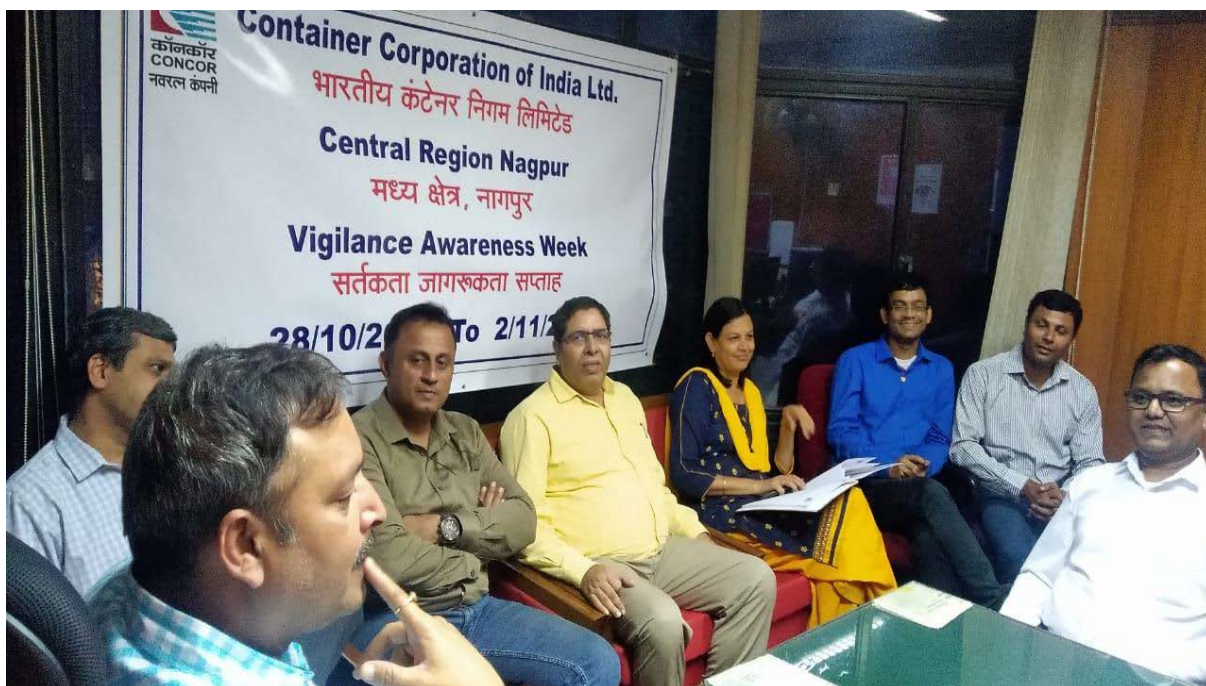
(Debate organized at CRO/Nagpur on 31.10.2019 on “Integrity – A Way of Life”) [Photo-B5]