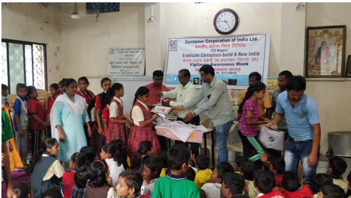
(Interactive Session with Students on Anti-Corruption at 'Rao Saheb Thavre High School', Babulkheda, Nagpur) [Photo-C6]