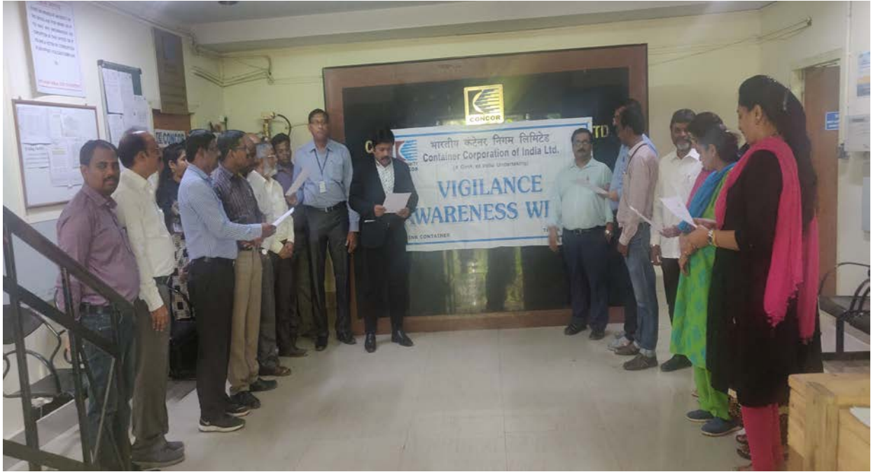
(Integrity Pledge was taken by the officials at Southern Regional Office, Chennai) (Photo-A5)

(Officials posted at Western Regional Office taking Integrity Pledge at Mumbai during VAW-2019) [Photo-A6]