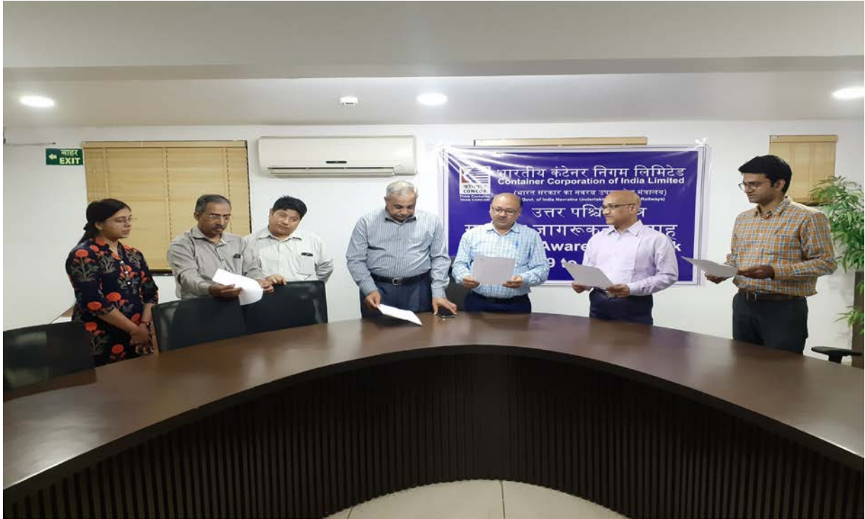
(Integrity Pledge was taken by officials at North West Regional Office, Ahmedabad) [Photo-A3]