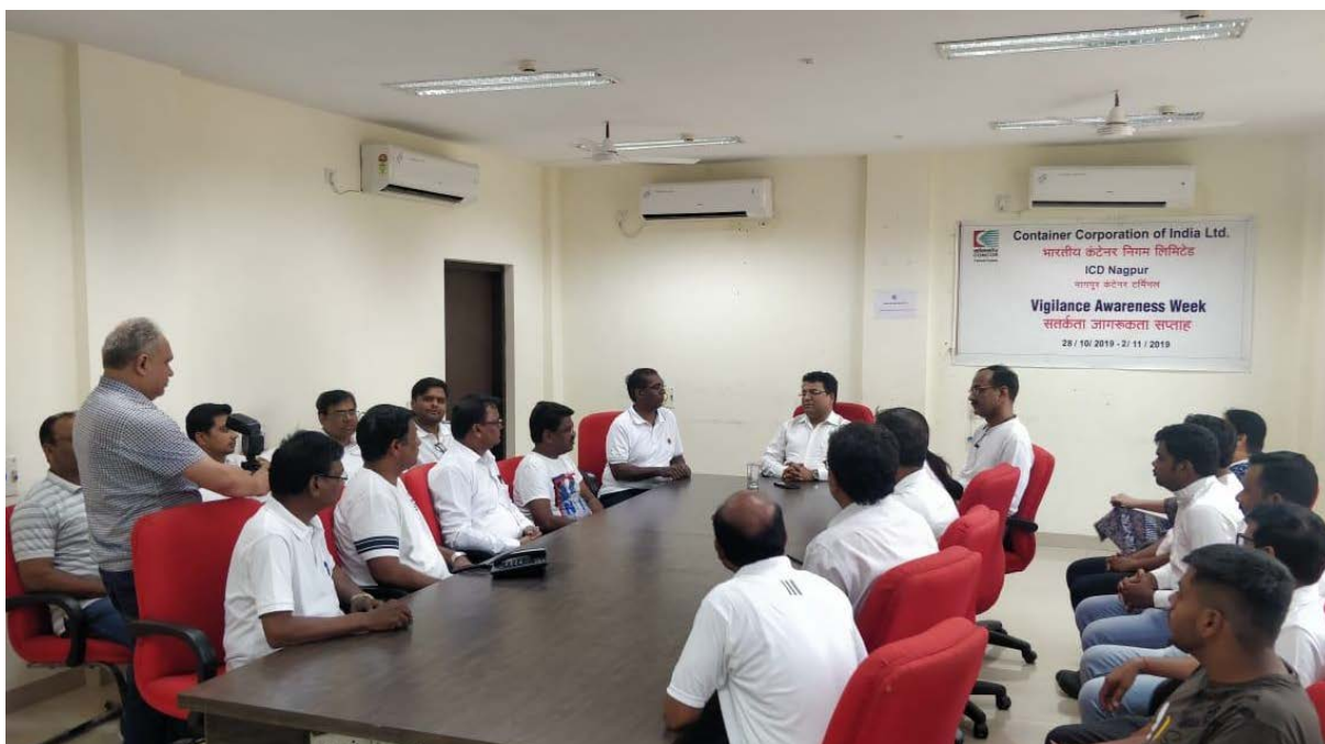
(Workshop organized at CRO/Nagpur for briefing on “Integrity – A Way of Life”) [Photo-B11]