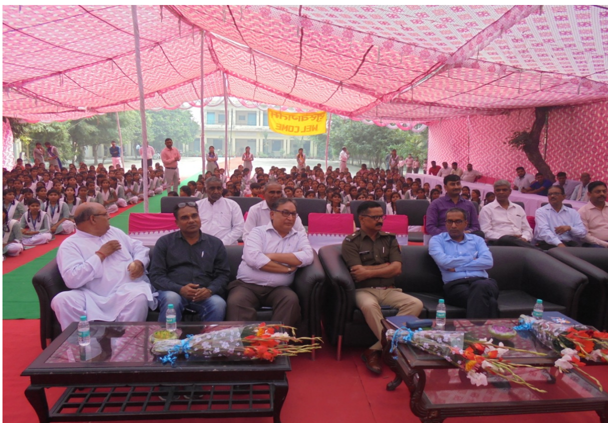
(Debate Competition & Cultural Programmes on “Integrity – A Way of Life” organized on 01.11.2019. at Adarsh Balika Inter College, Tilpata Village, Dadri) [Photo-B6]